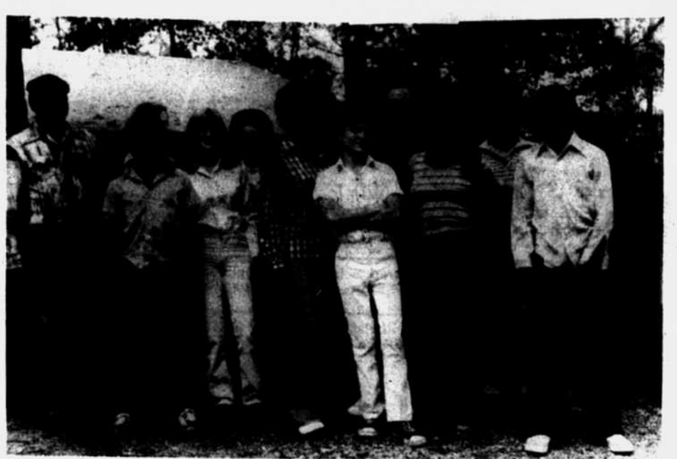
MECKLENBURG COURT PROBATIONERS