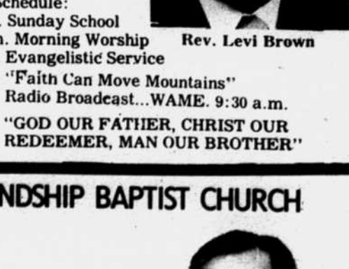
FRIENDSHIP BAPTIST CHURCH