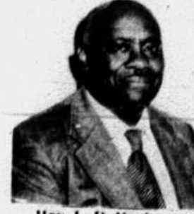
"Where Christ Is Preached As He Is,