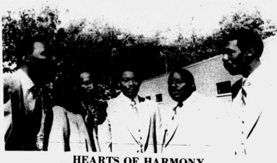
HEARTS OF HARMONY

To date the group has sung in various churches in the community. They also sing most Wednesdays and Sundays at Camp Green to other residents. Members believe firmly that their singing may help others realize the glory of knowing Christ. "We are all