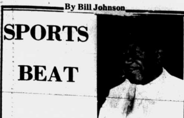
I WISH I HAD THE ANSWER!.....

Those of us who look for Johnson C. Smith University to develop a first class athletic program without the benefits of a total commitment program are more foolhardy than those of us who feel President Ronald Reagan is not serious about his proposed budget cuts.