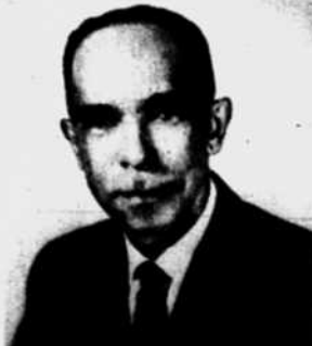
.First pastor Church.

On January 27, 1952 with 17 charter members present, the Statesville Ave. United Presbyterian Church was formed at a formal service at the Biddleville Presbyterian