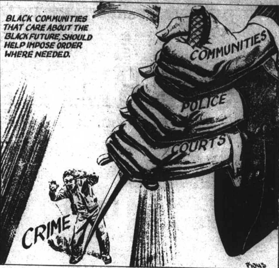
Answer To "Black On Black" Crime...Better Team Work!