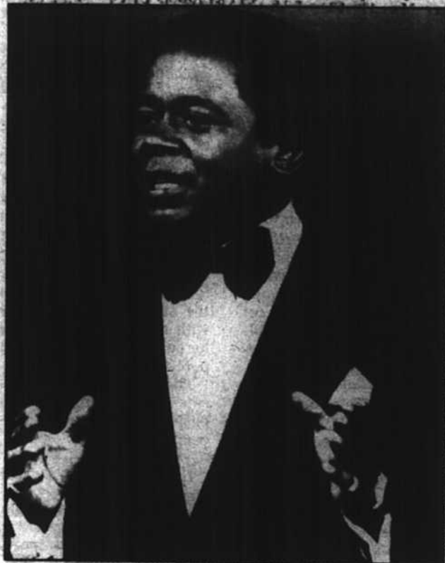
Flip Wilson is co-host, along with Lola Falana, of the 6th Annual Rhythm & Blues Award Special, Thursday night, May 28, 12:10 a.m. on WBTB, Channel 3.