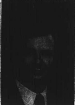
James Hunt ...N.C. Governor