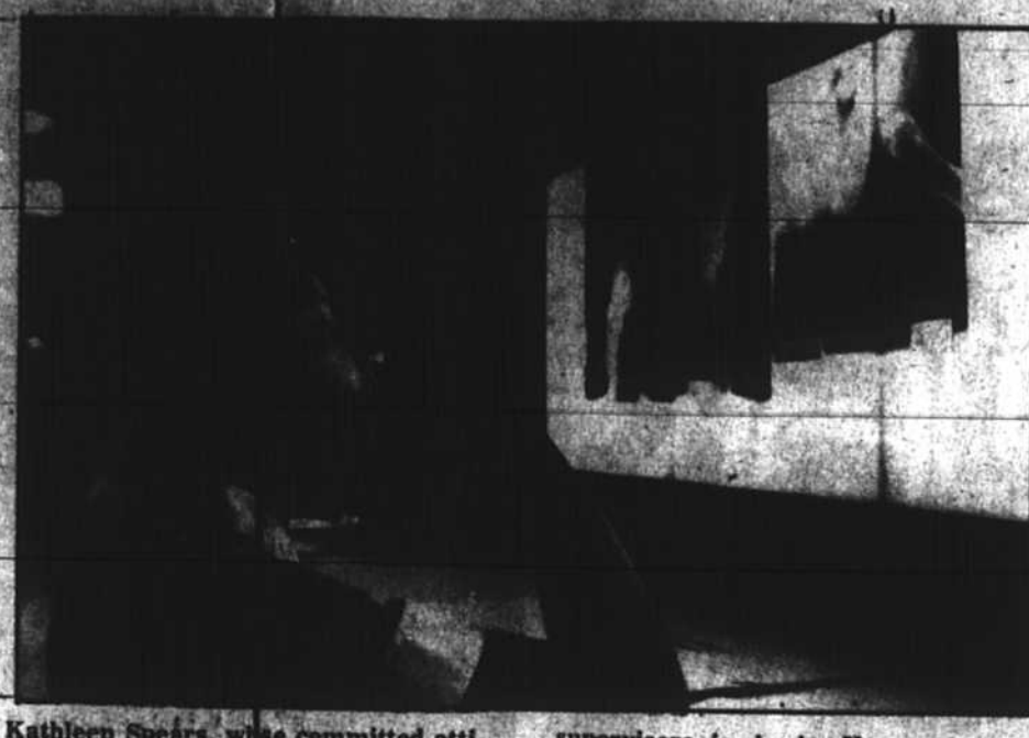
supervisors, is viewing X-rays.