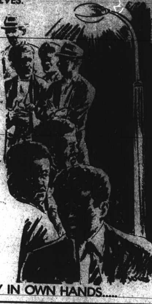
BLACK'S DESTINY IN OWN HANDS.....