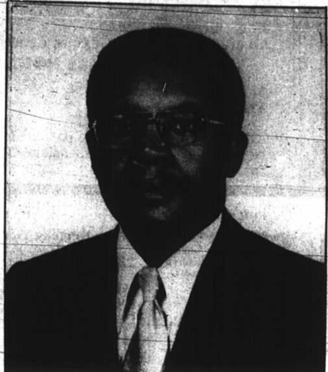
Third in series

II Samuel 9:5: "God is man a dead dog. 'I'm telling you what God says to man. It's not J.M. you are calling a liar. The Sovereign God of the Universe you are calling a liar. Yes, man sees before God as a dead dog; 'And he bowed himself, and said What is my servant, that thou shouldst look upon such a dead dog as I am?' That's what every sinner is out of Christ, just a dead dog. A dead dog can't even bark. What he can do is lie still. How much dignity is there in a dead dog? Every man out of Christ, I don't know how religious you are, you're just a dead dog. It doesn't matter how much scripture you know, how many truths you know, how cultured you may be, out of Christ you are a dead dog. There is no life in a dead dog. What use is a dead dog? None. Just to be cast away. You may come back and say that old popular proverb: 'It's a dog eat dog world.' Listen to the word of God: Rev 22:15, 'For without are dogs, and sorcerers, and whoremongers, and murderers, and idolaters, and whosoever loveth and maketh a lie.' All those souls will be prever in the 'Lake of fire.' Note that dogs are included in that Scripture. Now listen to II Peter 2:22;