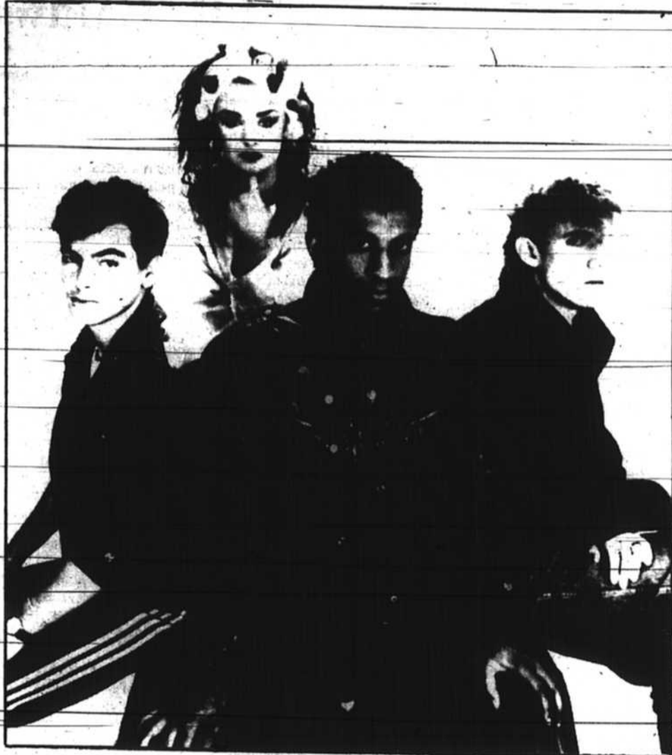
BRITISH GROUP CULTURE CLUB ...Headed by "outrageous" Boy George

Another practical rule that the group has enforced will undoubtedly assure them that they will stay on top. "We limit our indulgences - no parties, no bad vices," commented Boy George. Although Culture Club is composed of some very talented musicians, it is indeed Boy George who steals the show. He dresses in a full feminine costume, and he completes his act