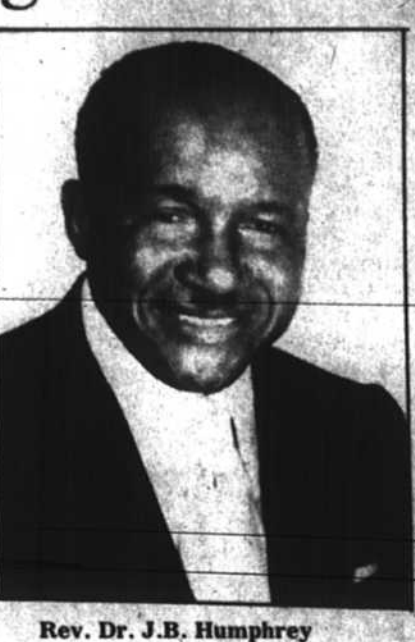
.. To be honored

You are cordially invited to attend all worship services at St. John. The