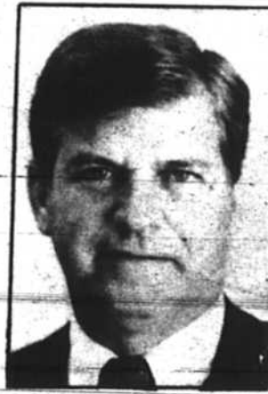
Jim Martin .....Gets endorsement