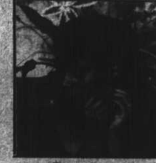
Tonya Downer Customer