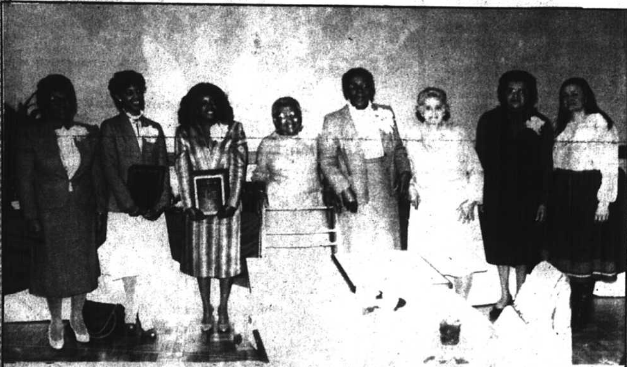
Herstory Day Celebration was sponsored by several Charlotte area groups honoring seven Charlotte women active in civil rights. The women are