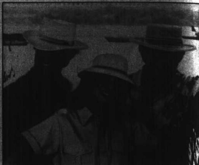
TAKING YOU FROM URBAN SIDEWALKS to a deck chair with equal ease, The Sunshine Straw Collection of fashion headwear by Dobbs. From left, the "Sarasota," handwoven of panaire formosan straw, makes a cool entrance for spring. Handwoven of polyhemp straw, the "Pith Helmet" is perfect for town or country explorers. The relaxed "Beachcomber" sports a wide brim and rainbow band.

of straw styles. With such a selection to choose from, each woman is almost certain to find at least one that is "her."