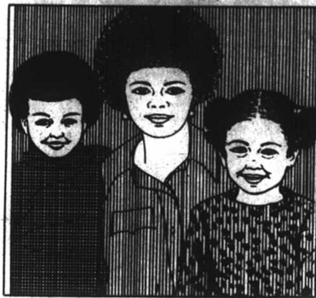
Good News For The Entire Family.