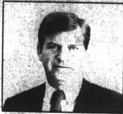
Gov. Martin ....."Work together"

state and local law enforcement agencies' crime prevention efforts. We must all work together to prevent crime, because a lack of cooperation only benefits the criminals."