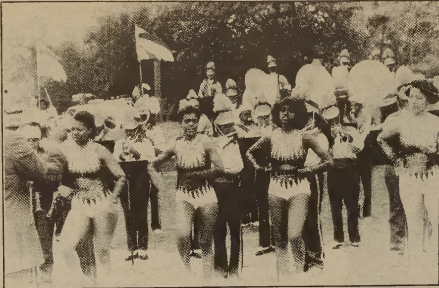
J. C. Smith Marching Band ...Strutting "their stuff"

said, "This is the best sounding and the biggest band I have seen since I've been at Smith in the past four years."