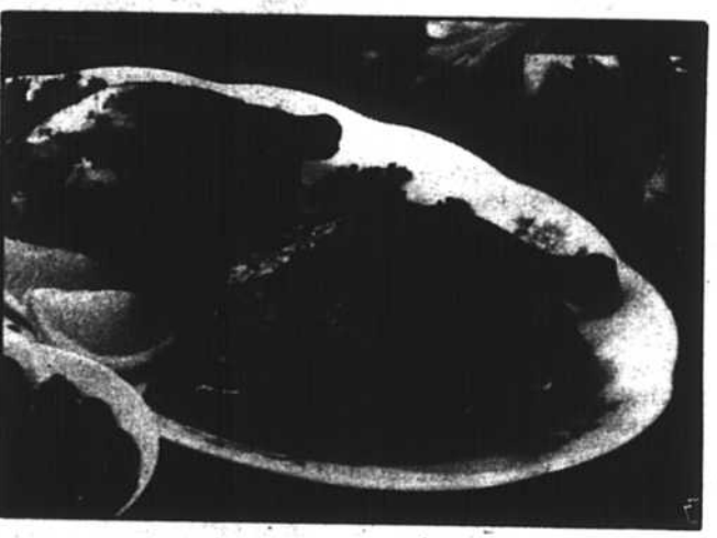
Cornish hens are glazed with cranberry mixture.

Remove and discard giblets and necks from hens. Rinse under cold running water; drain well and pat dry. Combine cranberry sauce, brown sugar, lite soy sauce, onion powder, cinnamon and 3 tablespoons water in small saucepan. Heat over medium heat until cranberry sauce dissolves and mixture is smooth (do not boil).