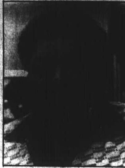
.....War is no good