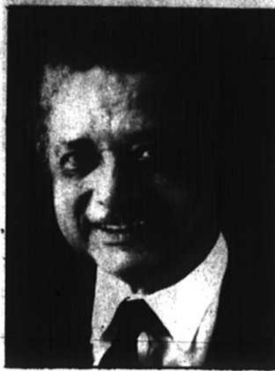
Rev. Leon H. Sullivan .....Philadelphia Baptist minister