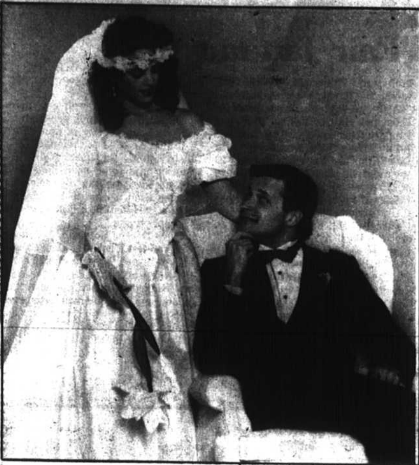
The above models give a sneak preview of the stunning fashions to be shown this Saturday.

The Best Buys Of 1986 Can All Be Found In The Charlotte Post Call 376-0496 To Subscribe