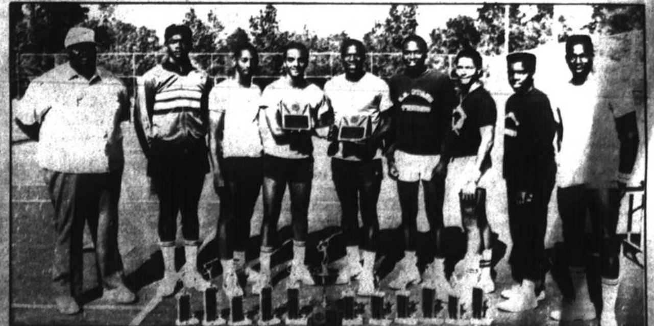
MEAC CHAMPS, AGAIN -- For the third consecutive year, the men's tennis team at South Carolina State has captured the Mid-Eastern Athletic Conference's tennis championship. The three-time champions, who won a school record 21 matches against just three losses, accomplished their latest feat at the MEAC Spring Championships (April 18) at Orangeburg, SC.