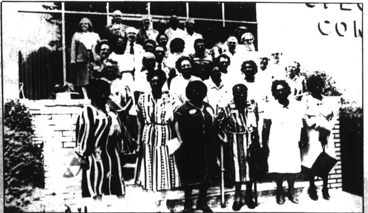
Radiator Specialty Company recently honored its former employees during the firm's annual retirees' day. Retired employees were treated to a luncheon