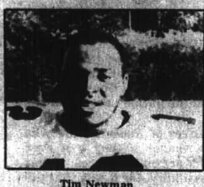
...Sixth in conference