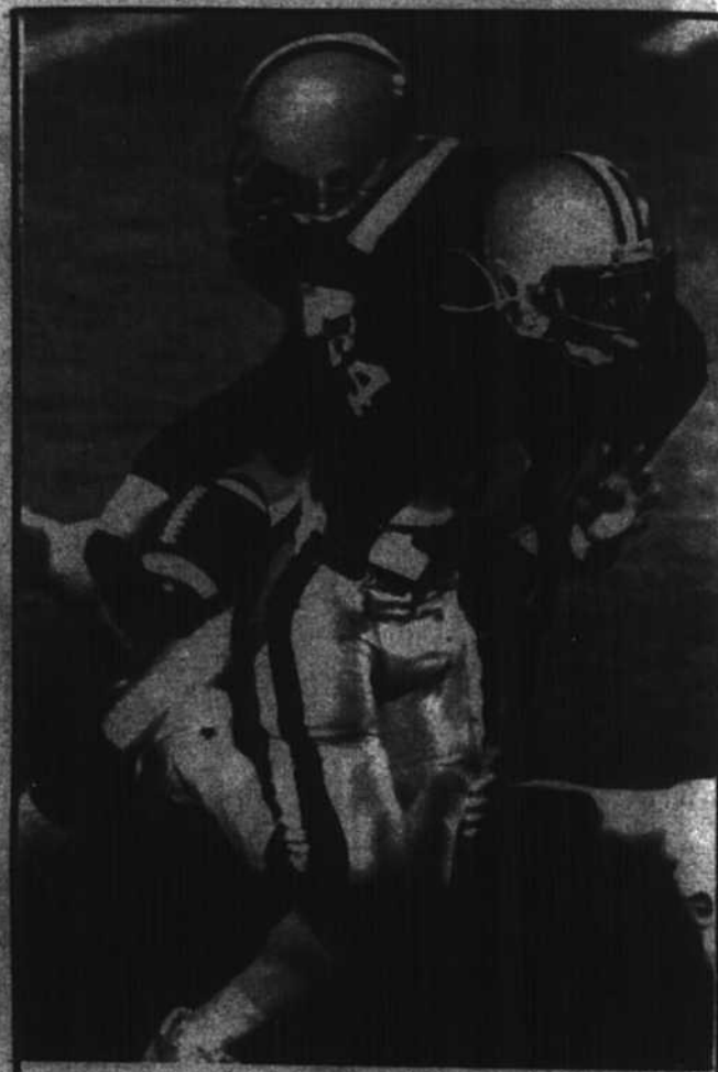
Plenty of backfields will be in motion during the CIAA's 1986 Football season.