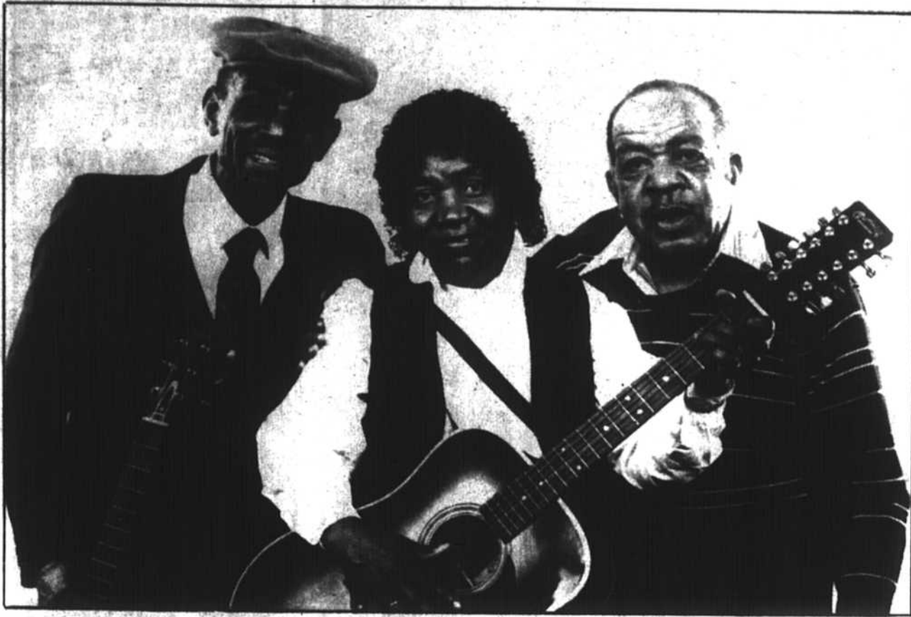
Blues and Gospel tour to perform at West Charlotte Senior High