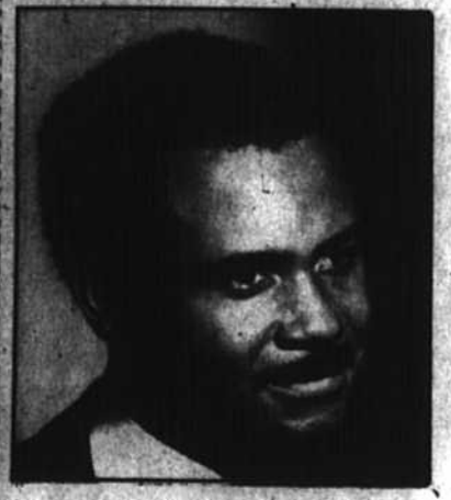
Mayor Harvey Gantt