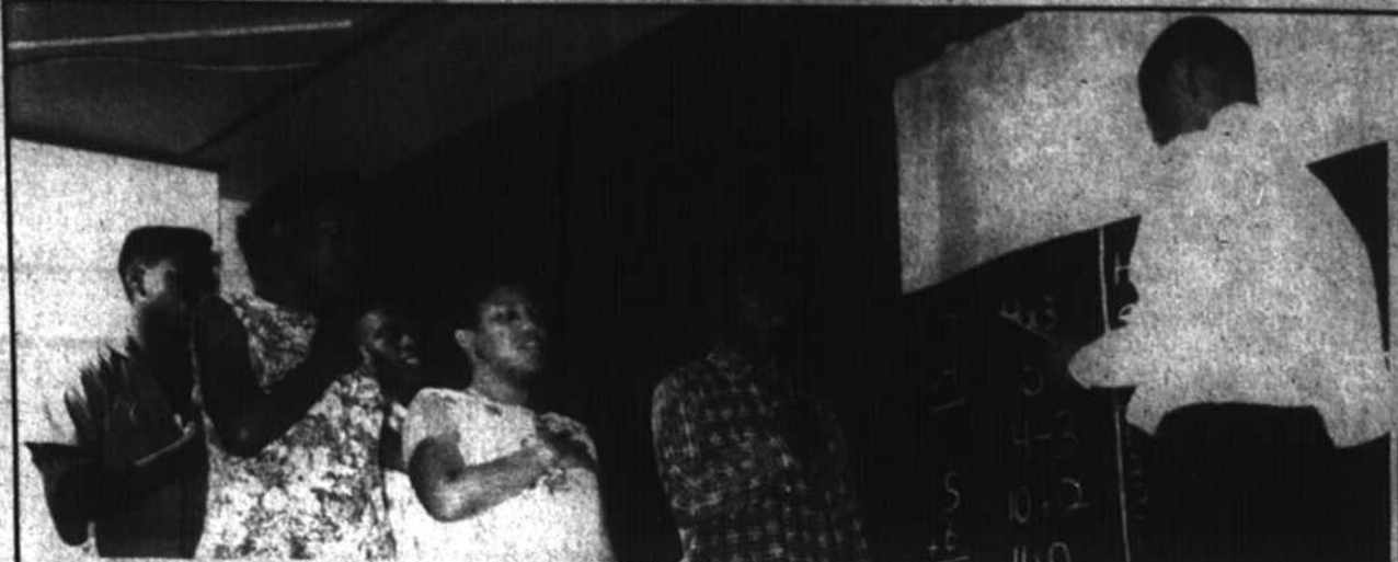
Students in the Kennedy Jr. High School Multi-Media Talent Production pledge allegiance during a school scene in "We The People."

who researched and wrote the dialogue. The talent production celebrated thirty years in Southwest Mecklenburg Community.