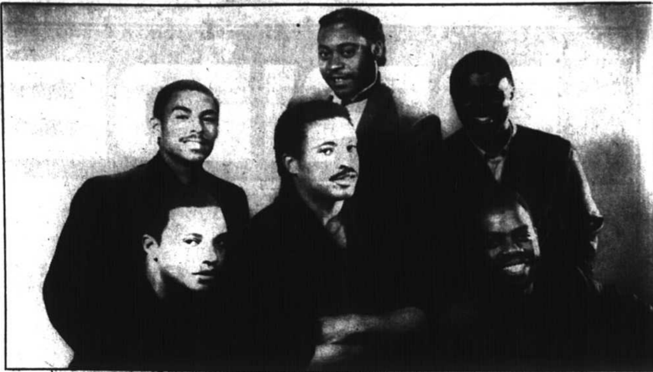
With a combination of talent and perseverance, the up and coming band, Valence is sure to be a smashing success.