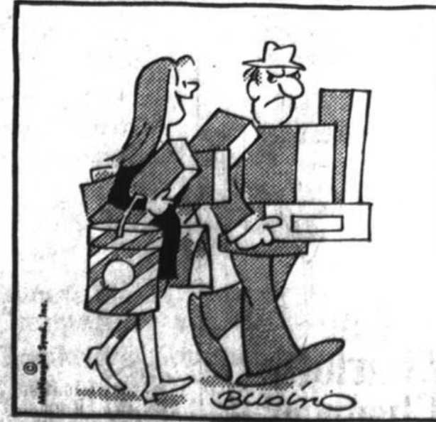
"I AM fighting inflation. I'm buying today before the prices go up tomorrow."