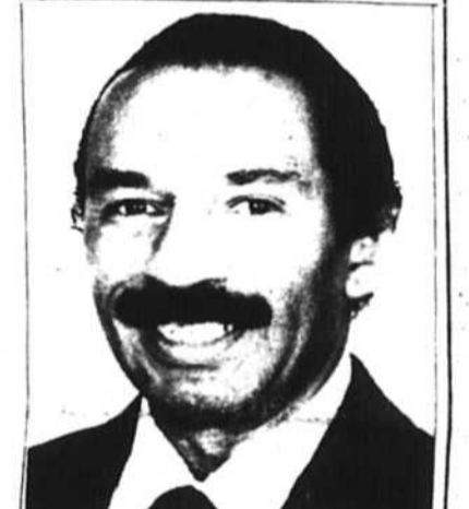
Rep. John Conyers

Taken together, these matters have created the impression of professional competence and ethical standards inconsistent with public office, especially that required of the nation's chief law enforcement officer. Because this im-