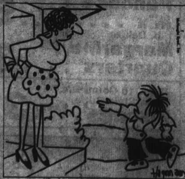
"It doesn't pay to be polite. I tried to make a girl go first at the dentist."