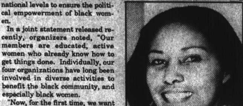
Nationally known speakers include former congresswoman

ber 3rd County-wide or Municipal Election, please call the Election Office at 336-2133.