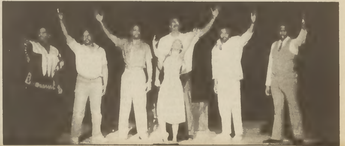
THE FINALE...The brothers, each distinct individual, explored and in the end discovered the way to love a black woman. A few qualities they decided should be included in the relationship are: trust, communication, and understanding.