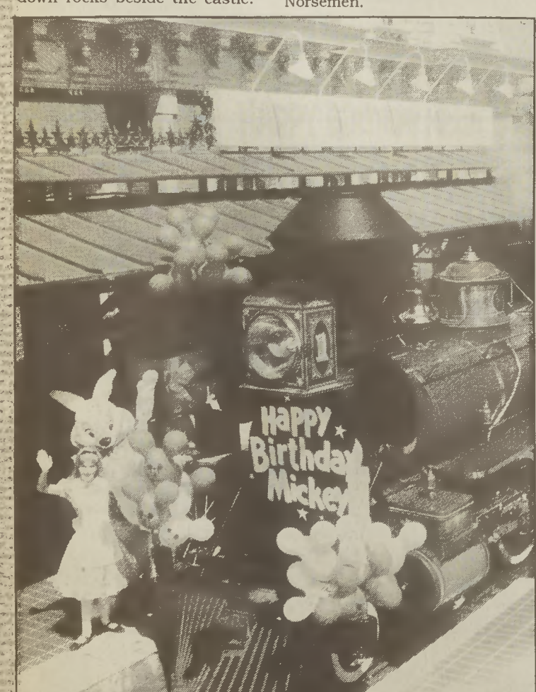
MICKEY MOUSE Birthday Train

Tickets on sale at the Hampton Coliseum Box Office and all Ticketron locations. For information call (804) 838-4203 All shows are subject to change without prior notice.