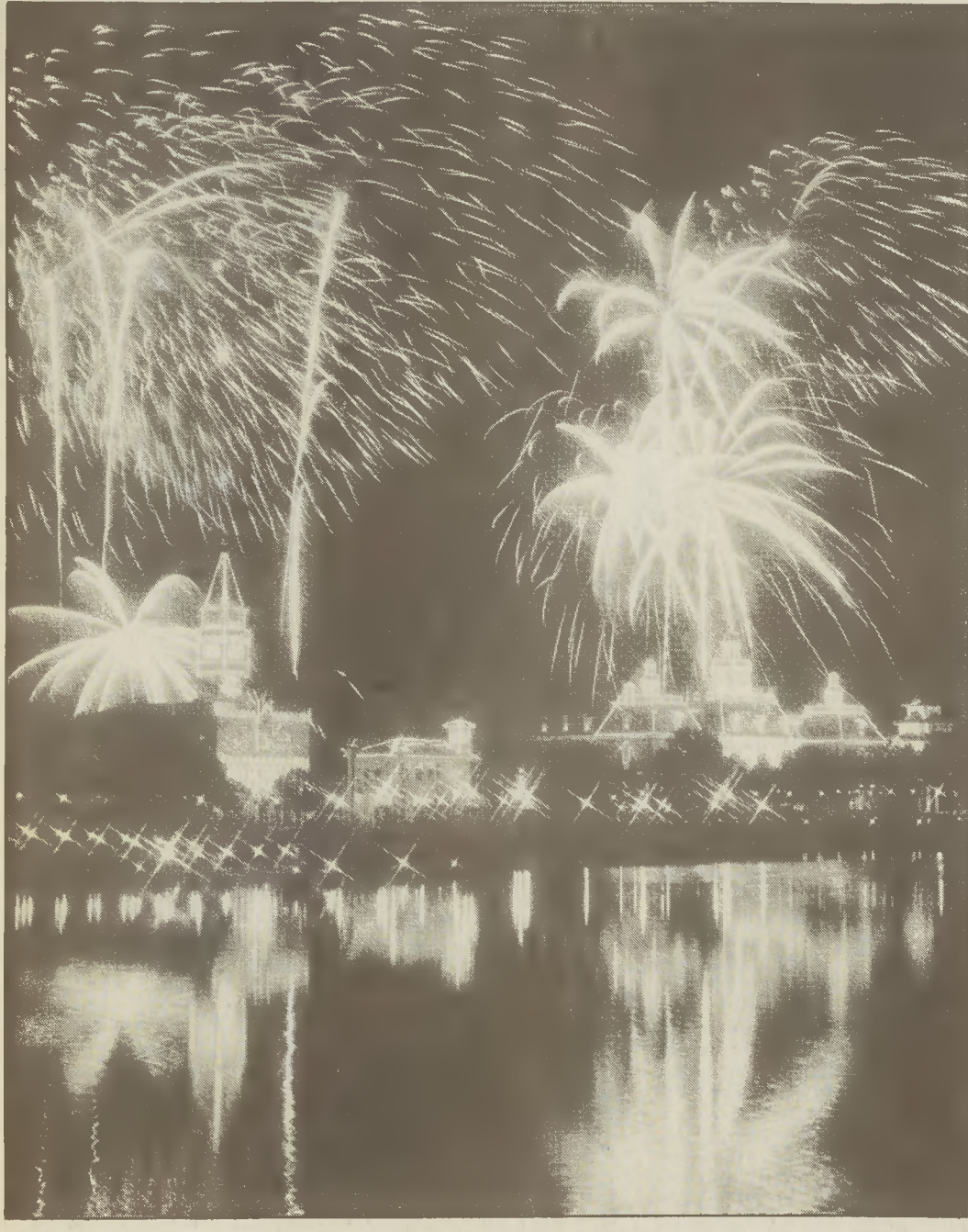
fireworks over EPCOT CENTER at night

By WILLIAM JAMES BROCK Post Entertainment Editor