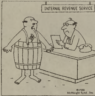
"What do you mean did I pay the sales tax on the barrel?"