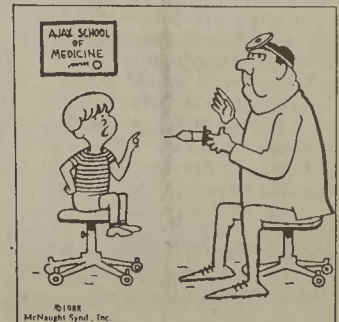
"Don't you have a disease that has cherry pie as an antidote?"