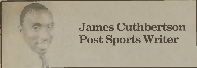
James Cuthbertson Post Sports Writer