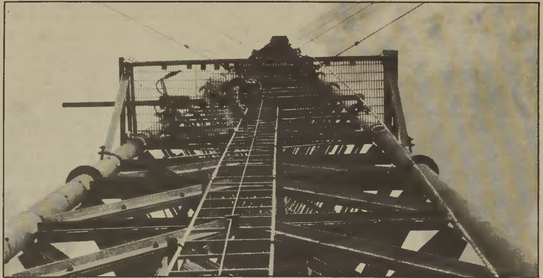
A construction worker looks down from the channel 36 broadcasting tower.

Less than a decade ago, NBC was third in network ratings. Today, NBC dominates the ratings with a