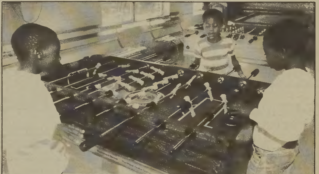
Children from the Erwin Community Center play a fun game of foosball.

Each of these meetings will be held in the library of the Gaston County Department of Social Services building located at 165 South York Street in Gastonia.