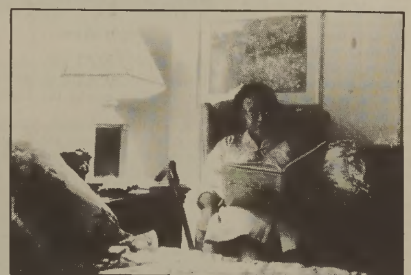
One-Bedroom Apartments (Bedroom View)