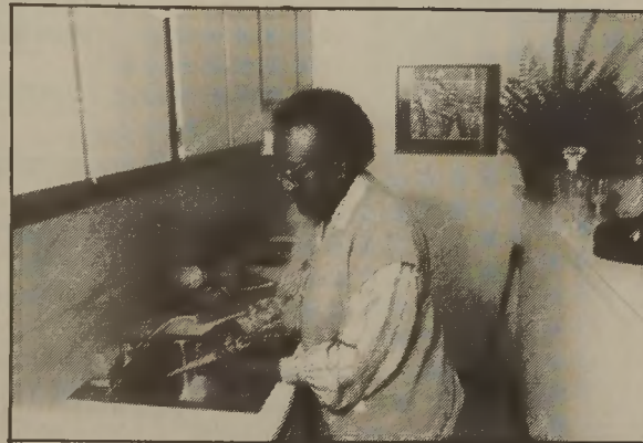
Eat in the Dining Room or Prepare Your Own Meals (Kitchen View of 1 Bedroom Apartments)