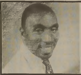
James Cuthbertson Post Sports Writer