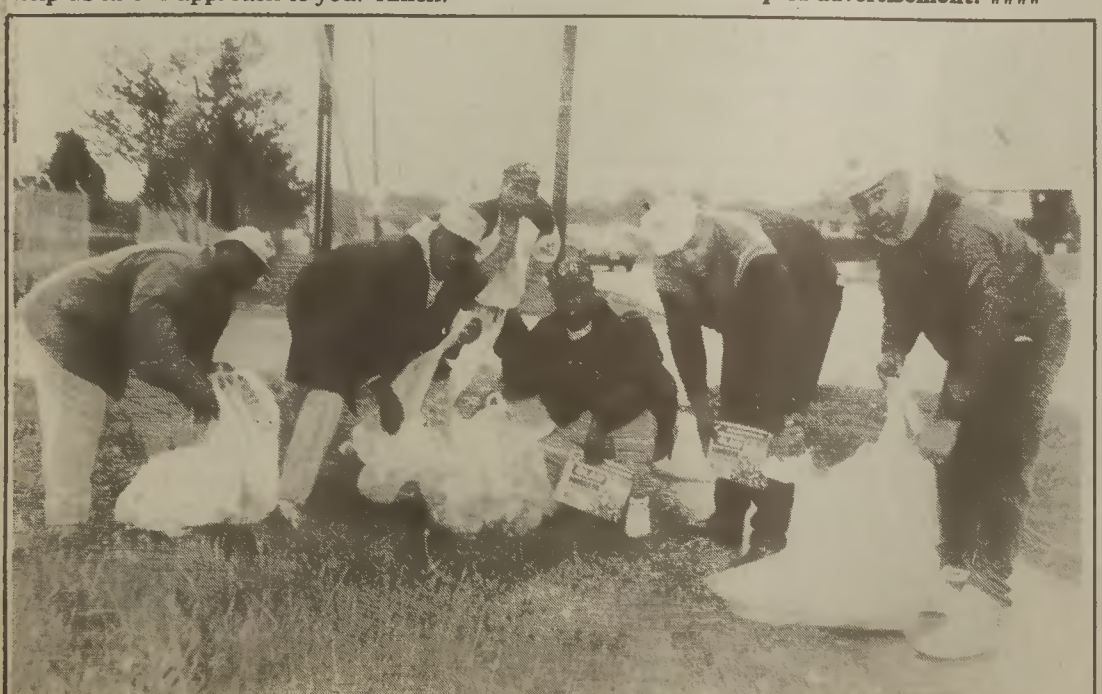
Despite the fact that it rained last Saturday, member of the Iota Phi Theta Fraternity, Inc., of Johnson C. Smith University, participated in the citywide Glad-Bag-A-Thon. They are shown

The Prophet's Column is a paid advertisement. ####