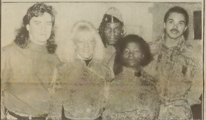
The group Curlio also performed at Pee's last week.