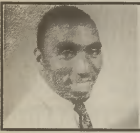
James Cuthbertson Post Sports Writer