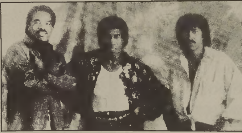
Chairmen of the Board

Carowinds opens at 10 a.m. and will be open until 9 p.m. on Friday, May 26, 10 p.m. on Saturday, May 27, and 8 p.m. Sunday and Monday, May 28-29. Except for the extended Memo-