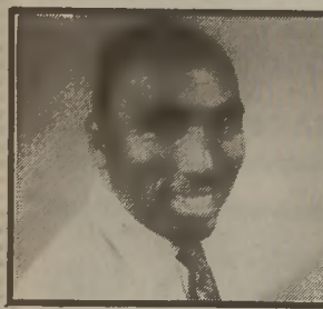
James Cuthbertson Post Sports Writer