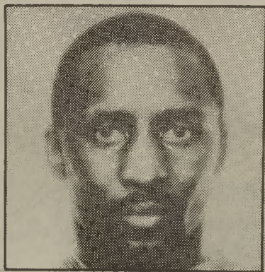
Thomas Hearns Oct. 18, 1958 Memphis, Tenn. 30 168 6-1 78 40 15 1/2 11 1/2

Leonard (35-1, 25 KOs), 32, now living in Potomac, MD, burst into the public eye as the darling of the 1976 U.S. Olympic boxing team in Montreal, winning the gold medal in the light welterweight division. He became a world champion for the