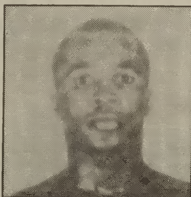
Sugar Ray Leonard May 17, 1956 Wilmington, N.C. Potomac, Md. 32 168 5-10 74 39 15 11

TALE OF THE TAPE Birthdate Birthplace Hometown Age Weight (approx.) Height Reach Chest Biceps Fist