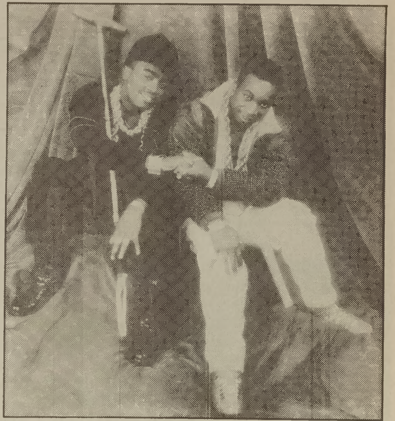
Kool G. Rap & D.J. Polo

Kool G. credits L. L. Cool J., Rakim, and Melle Mel with his present style. The former are smooth and mellow, and the latter, what Kool G. calls, "hard." His style cuts like "Road To Riches," is a combination of the hard and smooth rap traditions. With "It's A Demo" and "Road To Riches" under his belt, Kool G. Rap's upcoming LP, I Declare War , features more autobiographical hard core rhymes, and other tunes, described by Kool as, "sharp, attractive, catchy and brief..." Go for it!