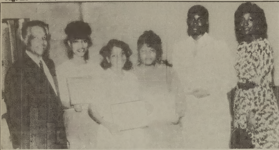
Five students who participated in the Charlotte-Mecklenburg Urban League's Enrichment program were awarded scholarships. Funds for the scholarships were raised through the Urban League Guild's Golf Tournament that proved to be quite a success.