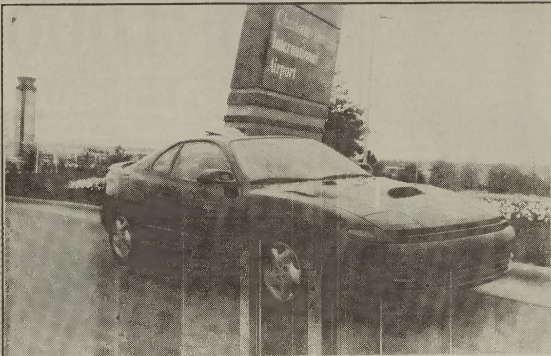
1993 Toyota Celica All-Trac Turbo

T here's a nasty rumor going around that when Toyota introduces its new Celica in a few months, the fire-breathing turbo model may go the way of the dodo bird.