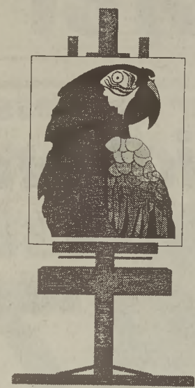
ART GALLERIES & EXHIBITS

GALLERY 4508 E. Independence Blvd, Suite 106 (Barclays Square). For more information, call (704) 532- 1521.